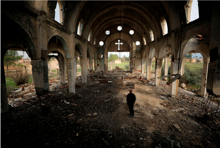
Figure 9.2 The Church of the Virgin Mary in Tel Nasri, Syria, devastated by ISIS on Easter Sunday in 2015.

the destruction of people and communities through physical genocide as defined in international law. 14 These attacks were so effective because they were embedded in a well-integrated system that combined religious ideology, a political agenda, extreme violence, and sophisticated propaganda—all amplified at a global scale to reach multiple, targeted audiences through Internet videos, digital magazines, and other social media. Nonhierarchical channels of Internet communication make these messages extremely difficult to counter or suppress.