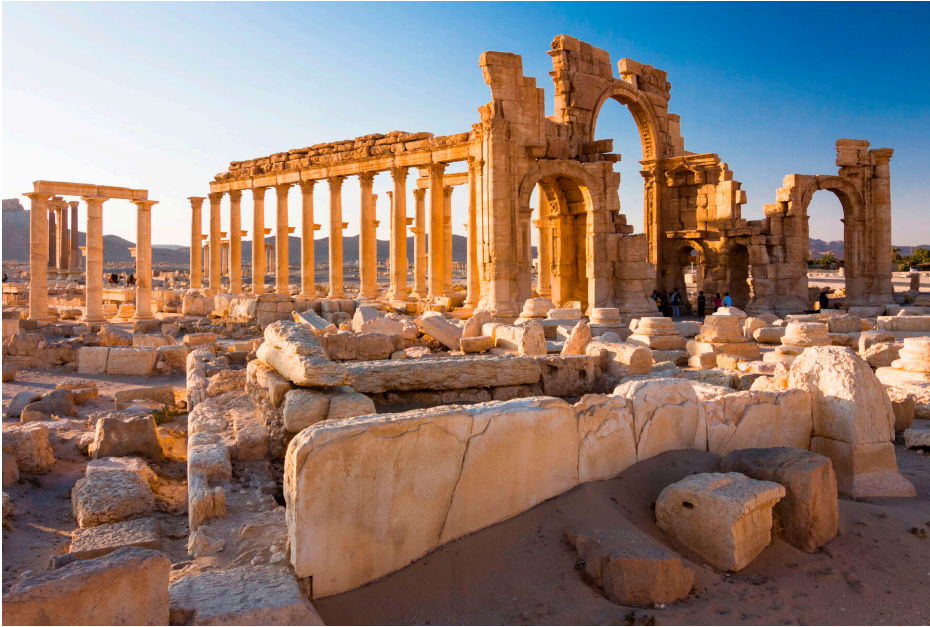
Figure 11.2 Remains of the Great Colonnade at Palmyra. The ruins of ancient Palmyra were one of the prime tourist destinations in Syria before the war and provided a source of employment for those who lived in the area.

and led to civil conflict. Therefore, ending the cycle of destruction becomes inherently related to how we preserve meaning and what we can do to defend and strengthen its existence in our built environment. With this in mind, an examination of the creation of the city of Homs may offer insight into how to address this pivotal issue.