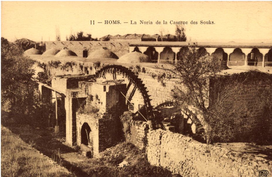
Figure 11.10a An historic photo of the Naourah ( noria ), or waterwheel, after which the city quarter Souk al-Naourah is named. The only remnant of the waterwheel today is the name of the neighborhood.