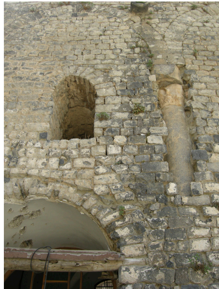
Figures 11.6b–c The war inflicted great structural damages to the mosque, revealing older pillars from a previous structure buried within its walls. These remnants might be seen as indicative of a unique preservation approach that opted not to tear down, but rather to build on.