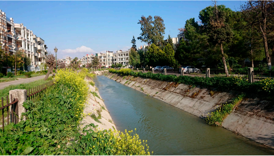
Figure 11.9a A 2021 photo of the irrigation network running through the city. Municipal decisions to let the water flow are followed by others to restrict it, an on-and-off approach not explained to the public.