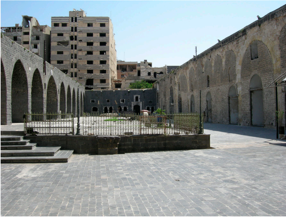
Figure 11.6a The main courtyard of the Al-Nuri Mosque. The structure is built of black basalt, the local building material of Homs.