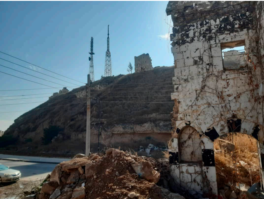
Figure 11.4b The Hill of Homs showing impacts of the recent war, including signs of structural deterioration on the neglected citadel.

establishment of Homs, which had previously been confined to the hill. By draining the river valley of its swamps, the dam made the location habitable (figs. 11.4a, 11.4b).