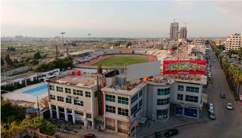
Figure 11.8 The necropolis of Tel Abu Sabun, now the site of the city's main stadium, built in 1960. Image: Marwa al-Sabouni

dynamited it to make room for an oil depot. The mausoleum, as documented in the drawings and photographs of nineteenth- and twentieth-century orientalists, was a two-story structure, the square base topped with an obelisk whose shape resembled the pyramidal tombs of Palmyra. Each facade was decorated with a row of five columns at the base and another row on the second floor. The building materials—the local black basalt and white limestone mentioned earlier—are a unique feature of Homs's architecture. The greater part of the necropolis had been excavated by 1952 and was reburied to build a municipal stadium (fig. 11.8).