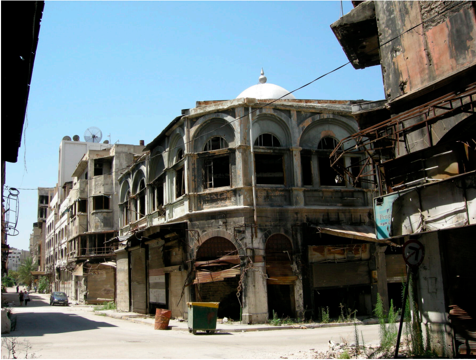
Figure 11.10c Another section of Souk al-Naourah, showing the French-style buildings that used to serve as offices and shops before being destroyed by the recent war.