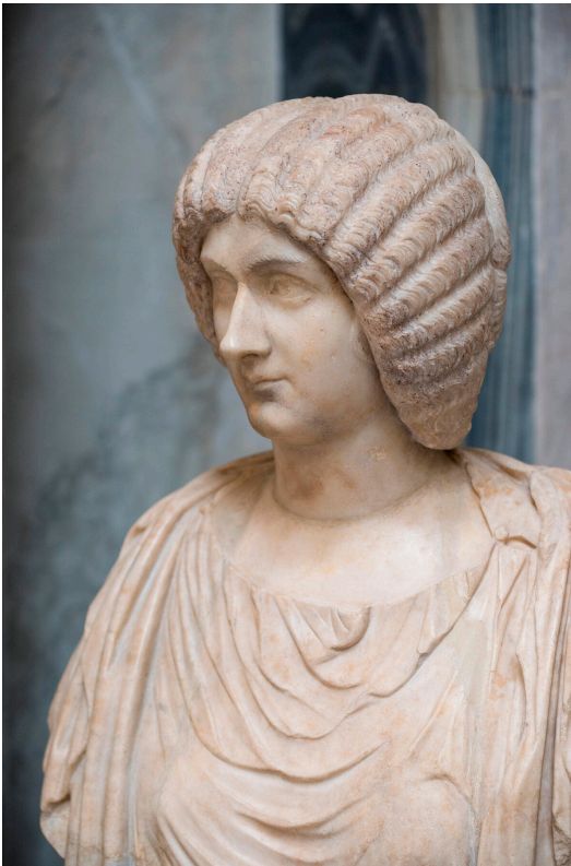
Figure 11.5 Julia Domna, the famous ancient queen born in Emesa (present-day Homs) and wife of Roman emperor Septimius Severus, who ruled from Rome in the third century CE.

However, it is agreed that while the city's ancient name of Emesa is pre-Roman, it continued to be used when Homs became a religious center in the first century. The solar deity Elagabalus (in Arabic, al-Gabal, the Mountain) was worshipped there in a great temple of the sun; the ancient city's coinage displayed an image of the temple with a holy basalt stone at the center. It was built by the ruling Sampsigeramids (or Emesene dynasty), an Arab family of priests who ruled after the Seleucid Empire. They made marital relationships with the Romans and ruled the city as a client kingdom.