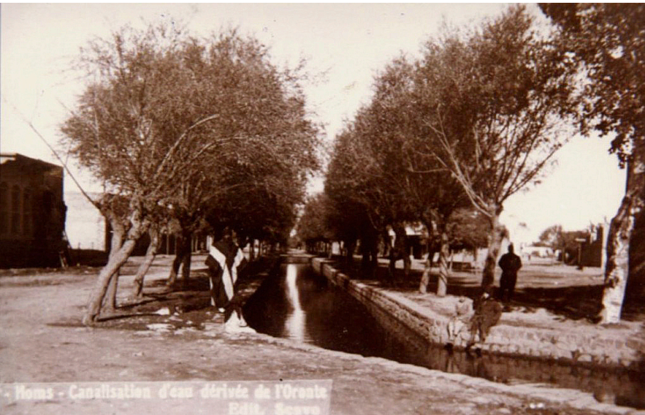
Figure 11.9b An historic photo of the irrigation canal of al-Mujahediya, a beloved part of the picturesque cityscape that was largely covered by roadways as part of so-called modern planning.