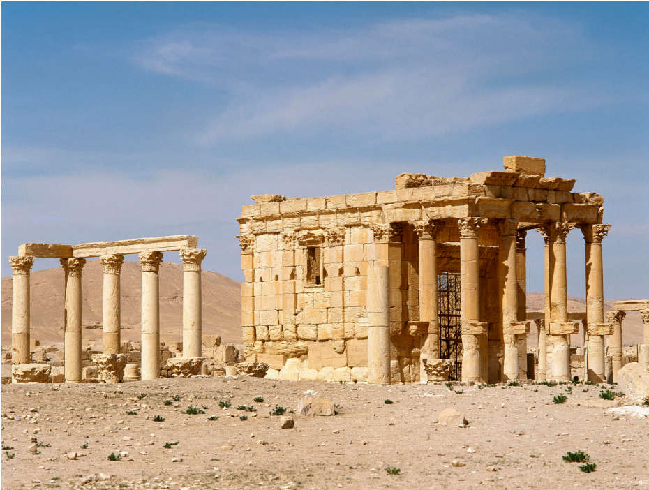
Figure 11.1 The Temple of Baalshamin, one of the most important structures in ancient Palmyra, before its destruction by ISIS in 2015.

a kind of centrifugal effect. At best, for most of the town's people, it was a source of income (fig. 11.2).