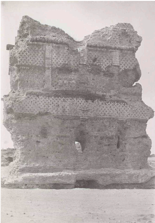
Figure 11.7 The mausoleum of Emesa. Its destruction by the city government in 1911, part of a systematic demolition of the city's identity, resulted in a great loss to the history of Homs.

But Homsis have had little chance to learn about this. “Emesa” and “Julia Domna” were no more than names of local cafés. Today, not much happens in the city. Its economic activity is slow in comparison to that of Damascus and Aleppo, its features are not interesting, and its history is little in evidence. Yet, none of this made sense: the city's location is central, its weather is mild and refreshing, its fields are wide and fertile, and its crops are abundant, as is its history. So why does the city seem to be in constant decline? The answer is multilayered, but the way in which the local government has administered the city's heritage may provide a clue.