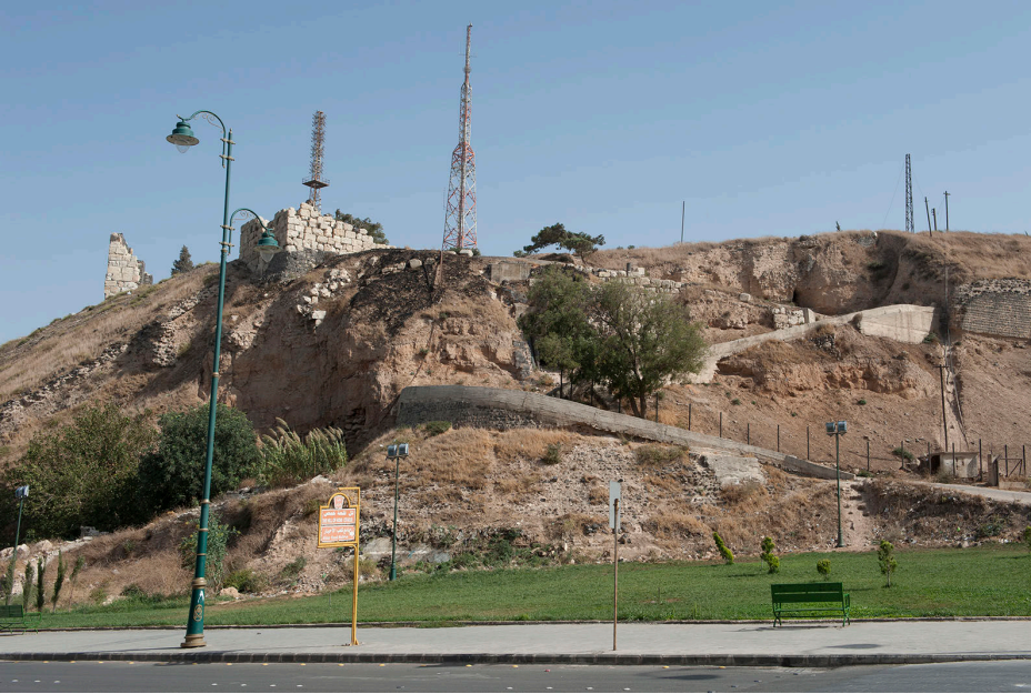
Figure 11.4a The Hill of Homs, where the ancient city was originally built.