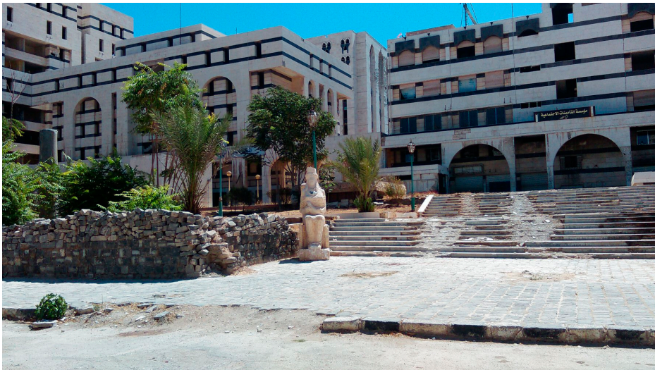
Figure 11.10b The Insurance Building in Souk al-Naourah. Construction of this complex required the demolition of parts of the historic quarter.