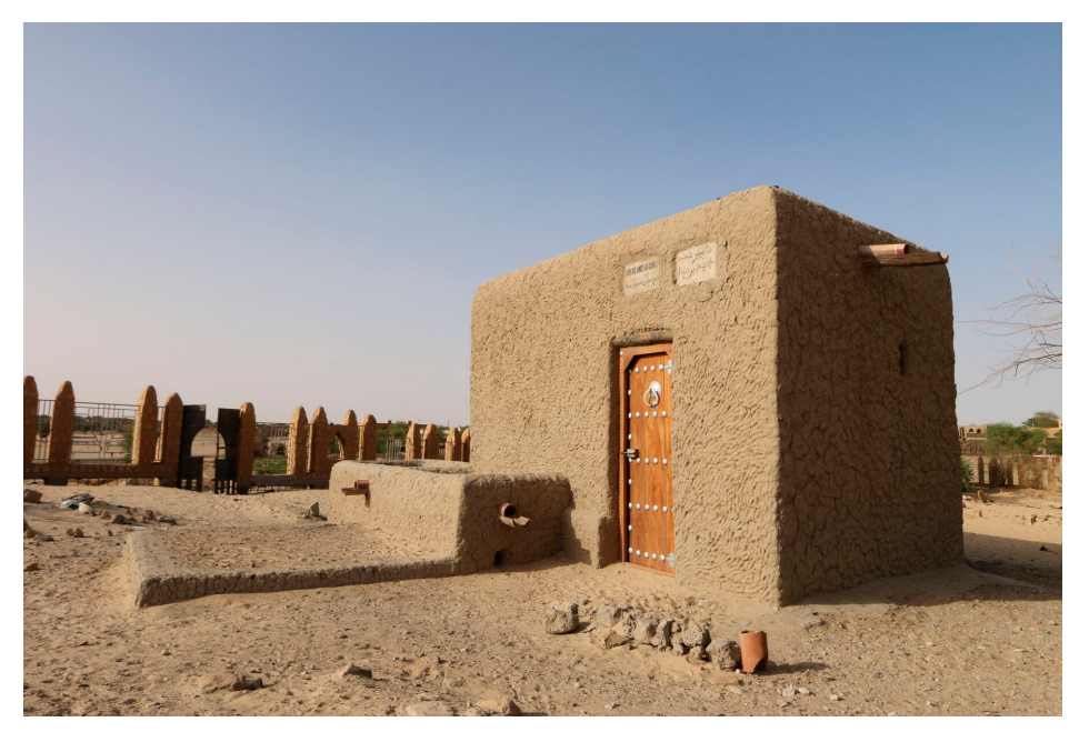
Figure 14.4 Reconstructed Sidi Ben Amar mausoleum.

Mosque. In Timbuktu these religious rites also represent the rejection of intolerance, violent extremism, and religious fundamentalism. This ceremony constituted the last step of Timbuktu's cultural rebirth after the destruction of the mausoleums (fig. 14.4).