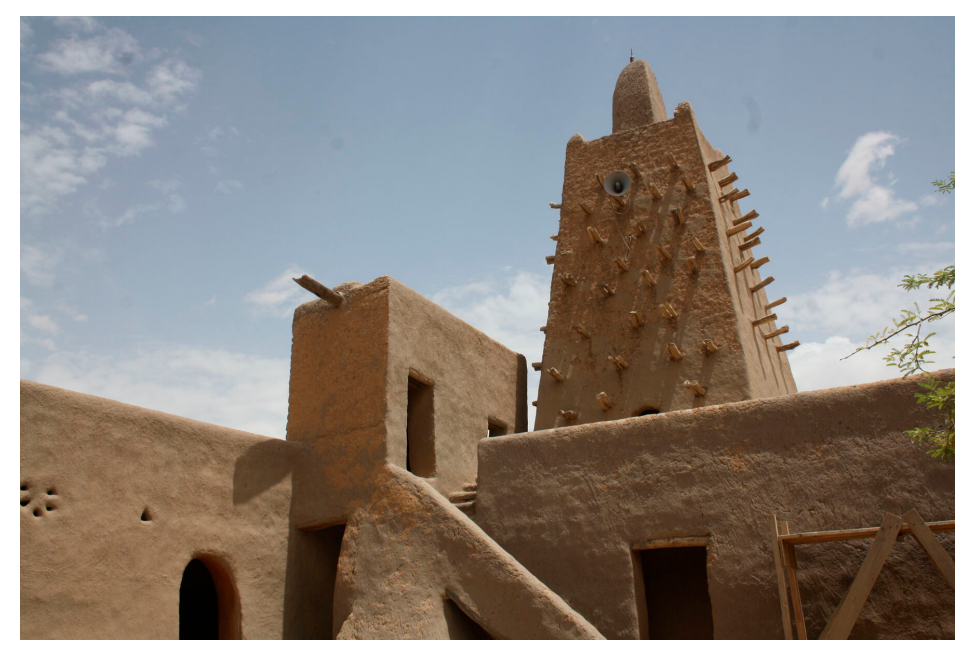
Figure 14.2 Djingareyber Mosque, built in 1325.

In 1988, three of the city's major mosques (Djingareyber, Sidi Yahia, and Sankoré) and sixteen of its saint mausoleums were inscribed on the World Heritage List.<sup>6</sup> These remarkable buildings played a major role in spreading Sufi Islam throughout Africa and are testimony to the golden age of this wealthy, spiritual, and cultural city. The mosques were built between the fourteenth and fifteenth centuries and were restored for the first time in the sixteenth century. The Djingareyber Mosque, the largest in the city and known as the "Friday mosque," constitutes one of Timbuktu's most visible landmarks (fig. 14.2). Although of more modest size, the Sankoré and Sidi Yahia are equally important.