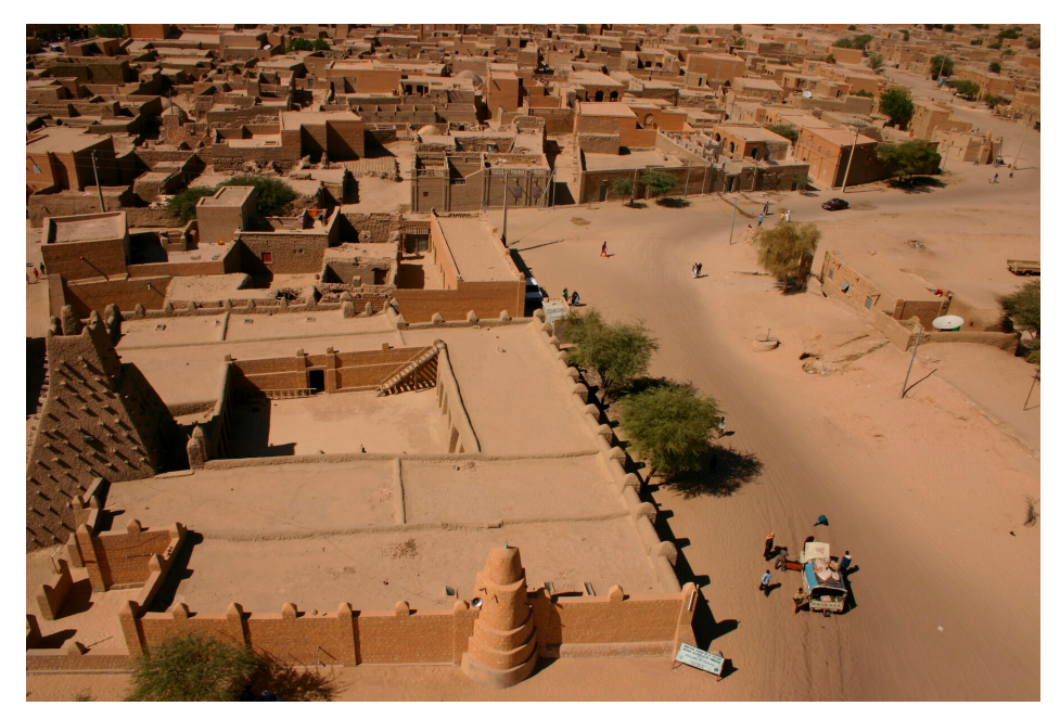
Figure 14.1 Aerial photo of Timbuktu.

explorers, and adventurers, and it became the intellectual measure of West Africa as well as an important center for the propagation of Islam throughout Africa in the fifteenth and sixteenth centuries. Its three great mosques at Djingareyber, Sankoré, and Sidi Yahia recall Timbuktu's golden age during the fourteenth and fifteenth centuries (fig. 14.1).<sup>3</sup>