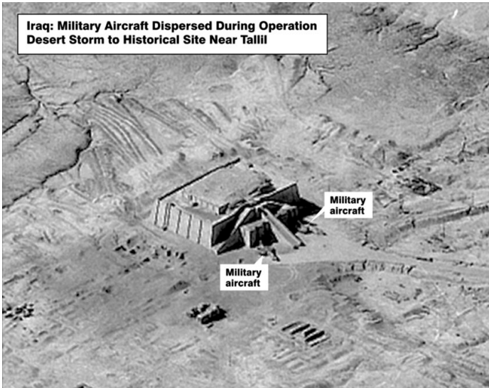
Figure 28.2 Iraqi military aircraft stationed near the Temple of Ur.

(without servicing equipment or a runway nearby) effectively had placed each out of action, thereby limiting the value of their destruction by Coalition air forces when weighed against the risk of damage to the temple.” 22